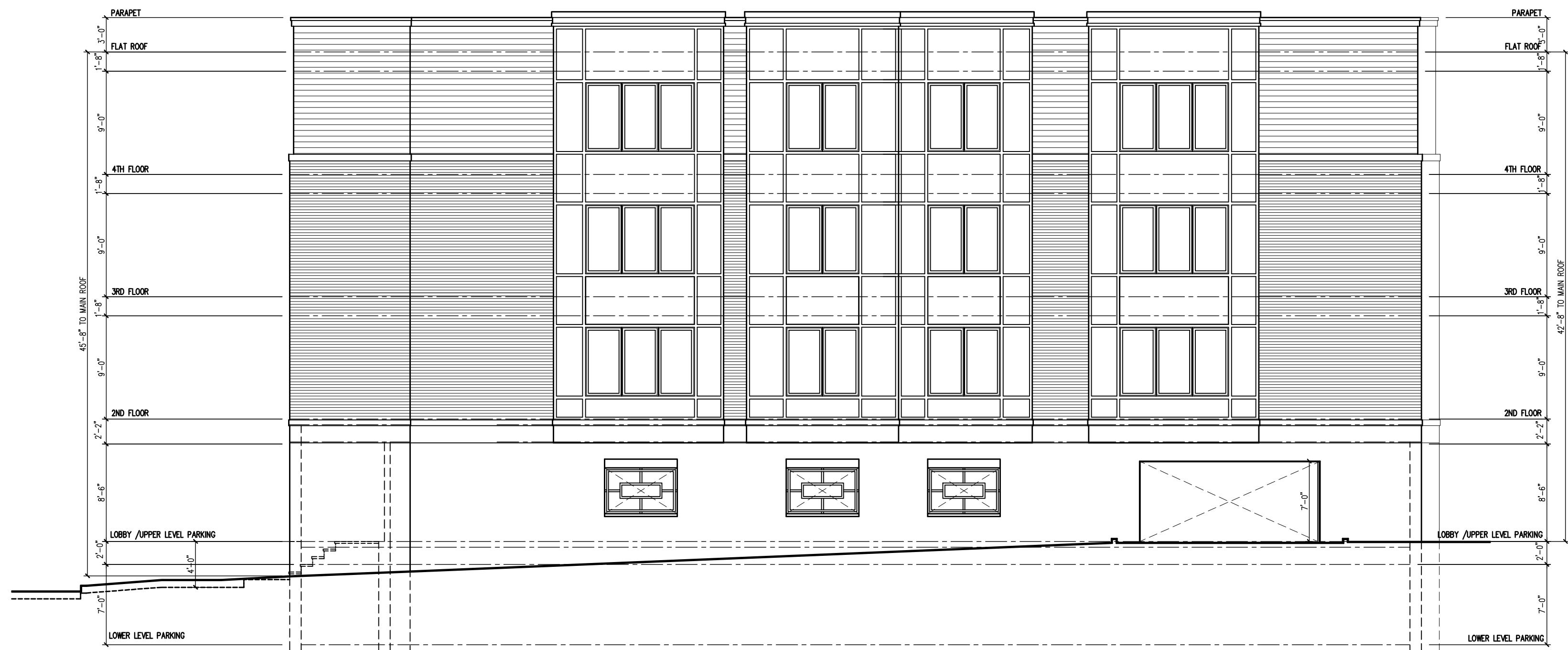
RIGHT ELEVATION - BERGEN BLVD. SCALE: 1/8" = 1'-0"