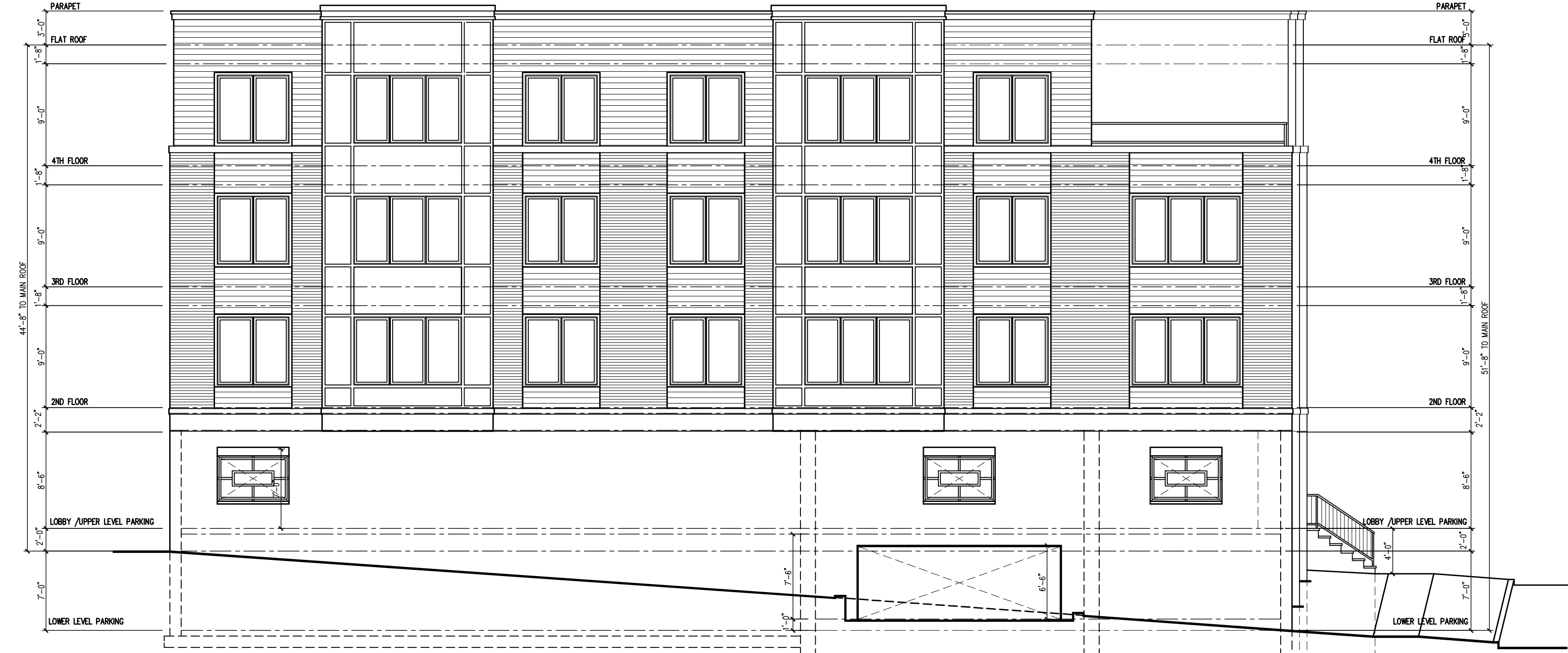
LEFT ELEVATION - 11TH STREET SCALE: 1/8" = 1'-0"